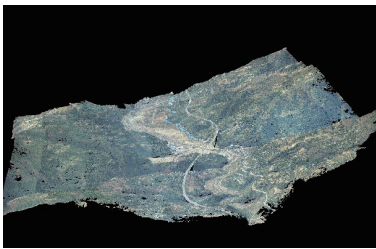
Nadir photos – Disaster monitoring

LiMapper supports data sources from both nadir and oblique photos. The true orthomosaic and other products can be used in geological disaster monitoring, surveying, forestry analysis, environmental management and other applications.