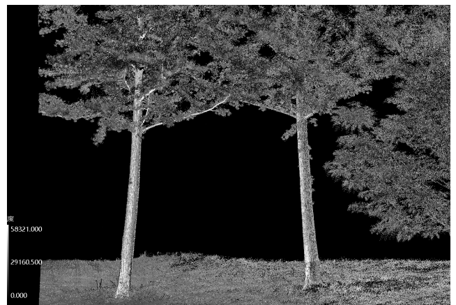
Tree scanning effect