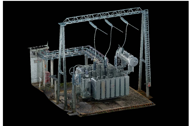
High-precision modeling and scanning of substations