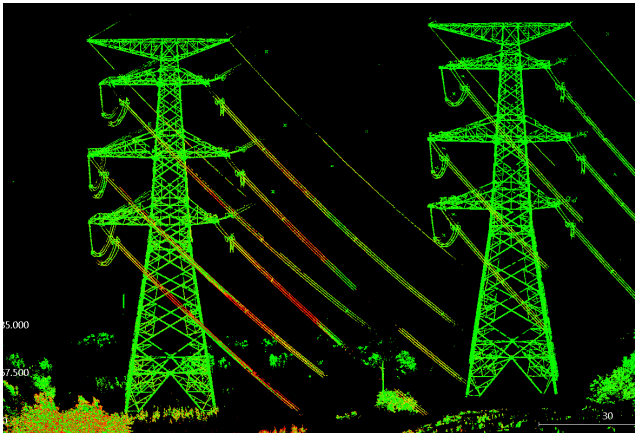
Fine scanning of power transmission no-fly zones