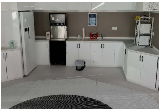
Indoor scanning and modeling