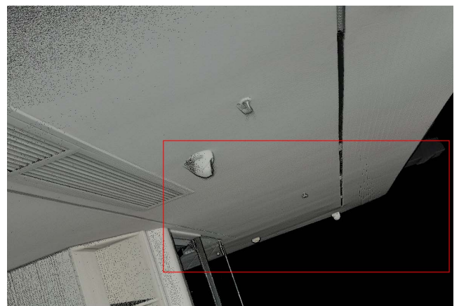
Wall flatness scanning and inspection